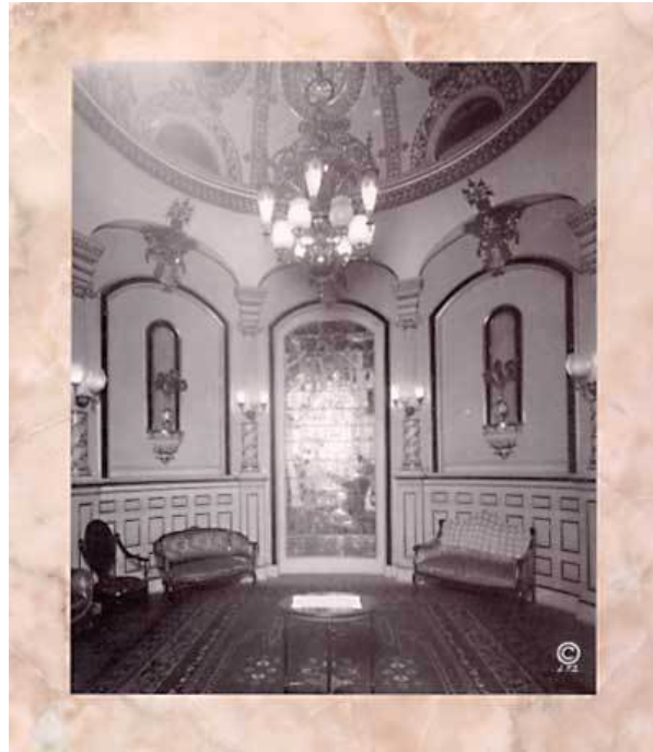
The Holy of Holies in the Salt Lake City Temple