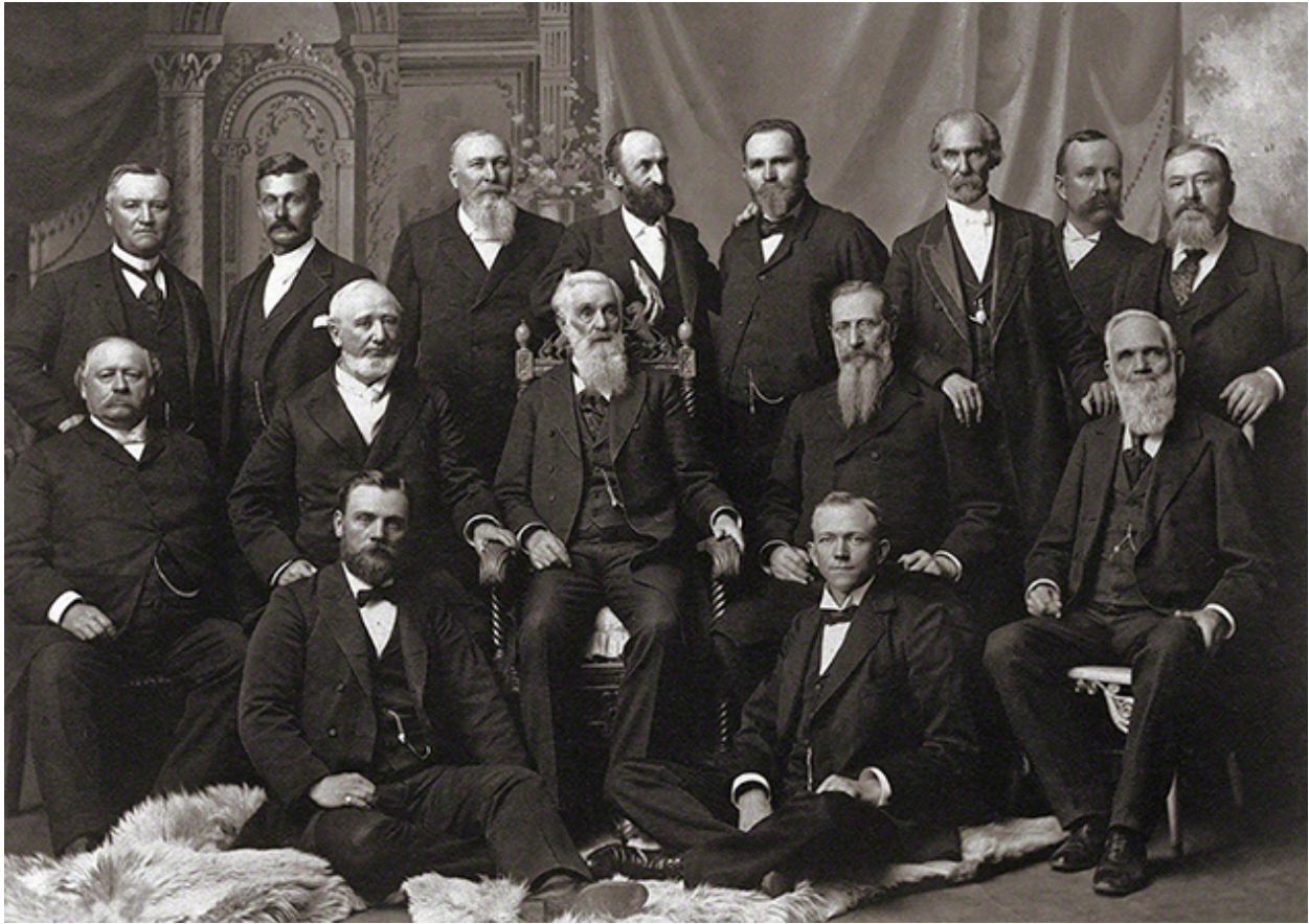
President Lorenzo Snow with his counselors and the Quorum of the Twelve.